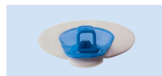
A = 4 mm connector