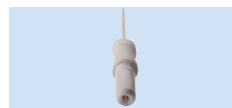
K = 1.5 mm connector