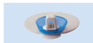
F = 3 mm connector