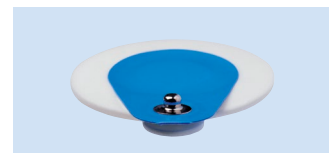
S = Stud