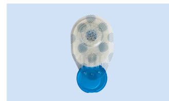
Printed release liner