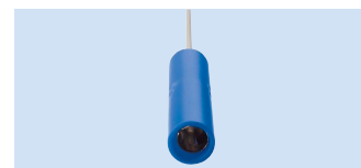
A = 4 mm connector