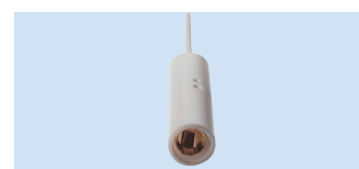
F = 3 mm connector