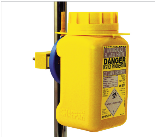
STAND OR TROLLEY MOUNT FOR 18 - 220 PLUS