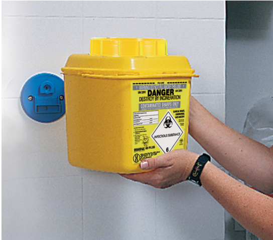
WALL, STAND OR TROLLEY MOUNT FOR 18 - 220 PLUS