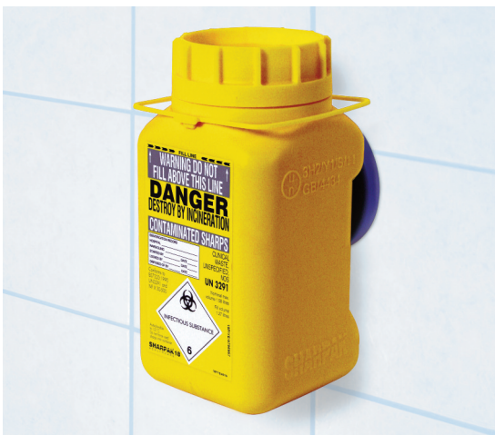
WALL MOUNT FOR 18 - 220 PLUS