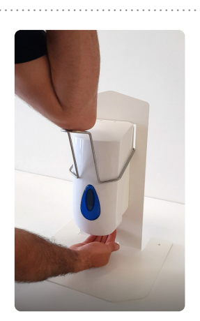
MANUAL DISPENSER Activate dispenser with elbow lever