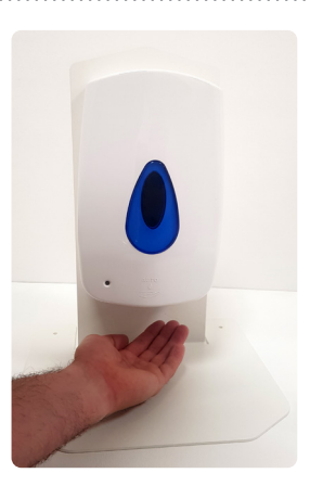
TOUCH FREE DISPENSER Touch free activation of dispenser