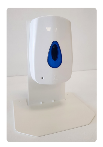
TABLE TOP STAND WITH TOUCH FREE DISPENSER

Free standing table top station making hand sanitiser available anywhere. Great for hospitals, surgeries, supermarkets and places with high traffic areas. For use with Brightwell Dispensers Modular touch free dispenser. Promotes good hand hygiene and makes it easy to keep hands sanitised in any facility.