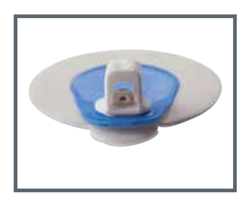
F = 3 mm fitting