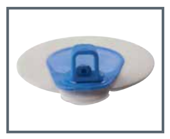
A = 4 mm fitting