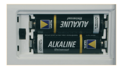
Operation with only 2 AA-size rechargable batteries