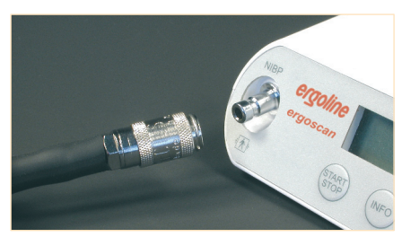
Metal cuff connector