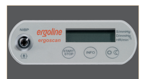
Thoughtfully designed control panel