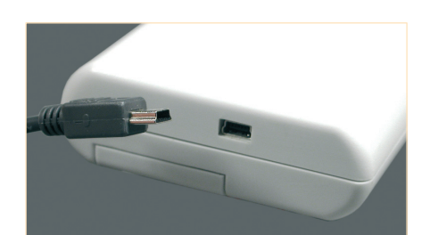
Reliable data transfer to PC