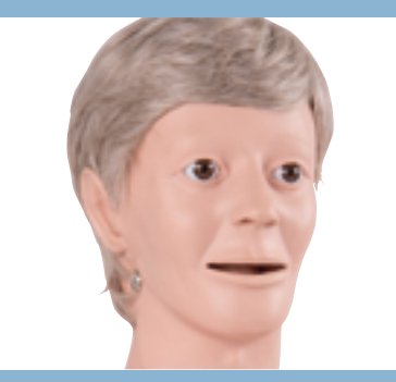
Hair care (washing, combing, drying)